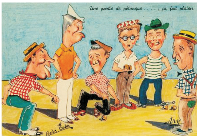
A game of Pétanque...it's a pleasure (...and don't we know it)

“Coonawarra – Australia’s other Red center”